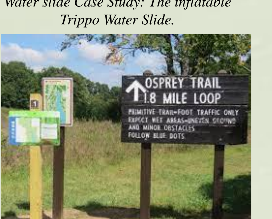
Signage to add for non-motorized bike paths.