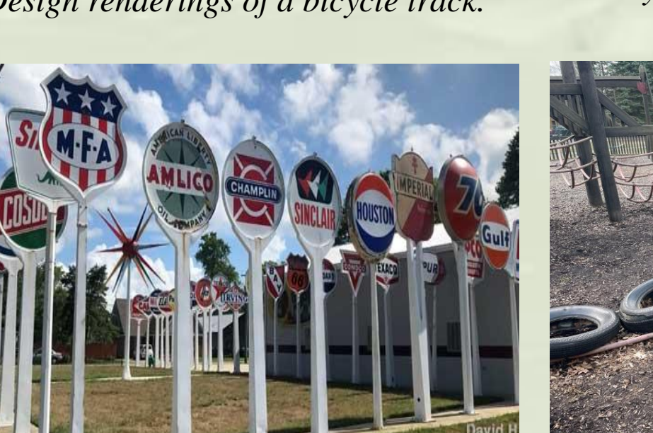
idea for mile markers.