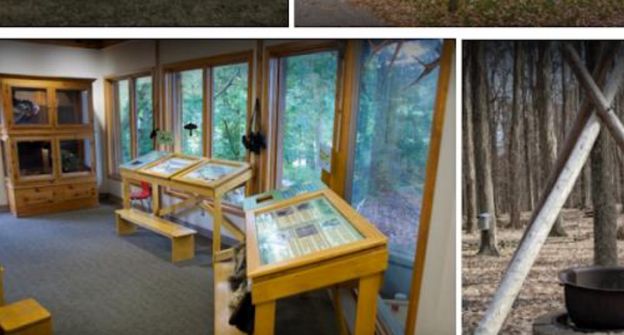
Nature center Case Study: Fenner Nature Center.