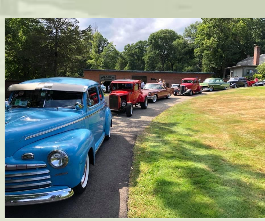
Classic cars at the Jack Frost Auto Museum.