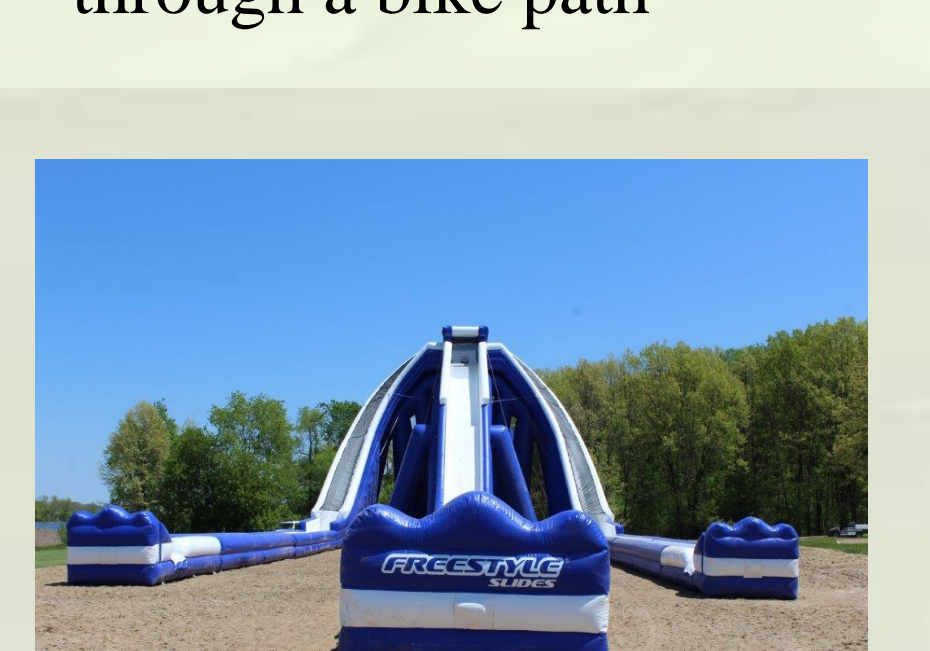
Water slide Case Study: The inflatable