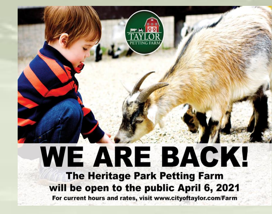
Petting zoo as an example of hosting more family-center events.