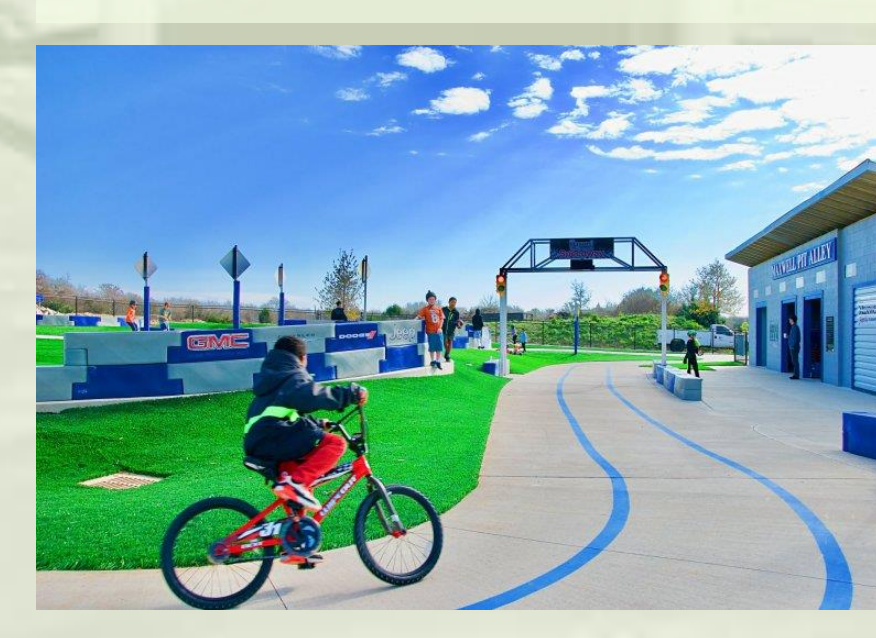
Design renderings of a bicycle track.